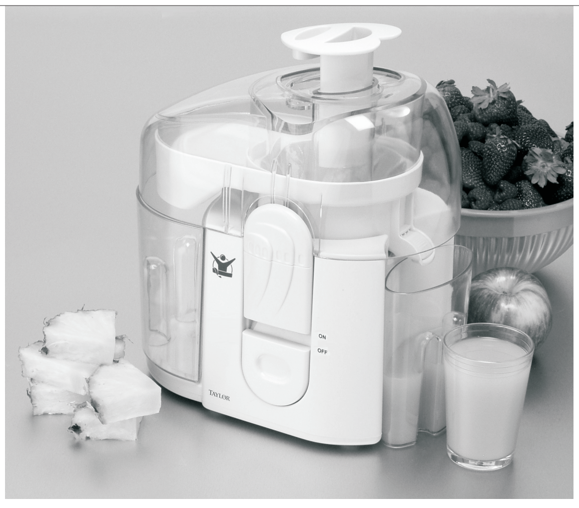
Item # AJ-1450-BL 120V ~ 60Hz 300W